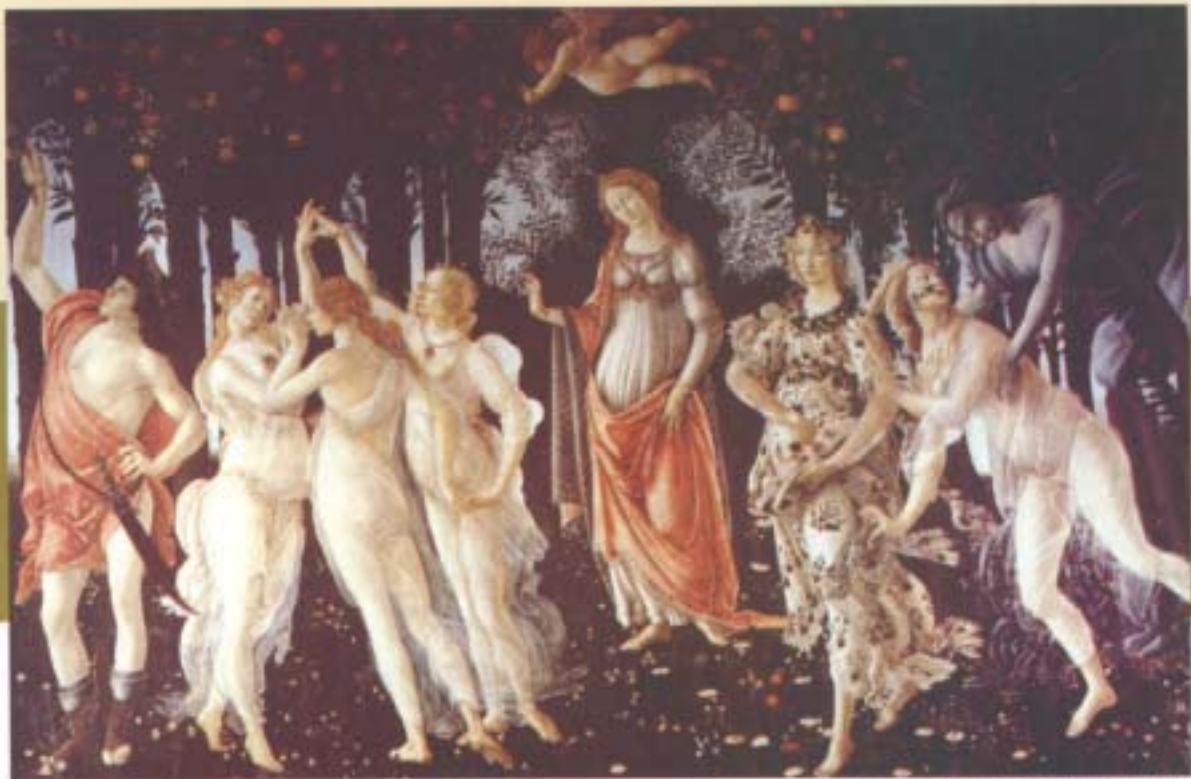
Sandro Botticelli, Primavera , c. 1482